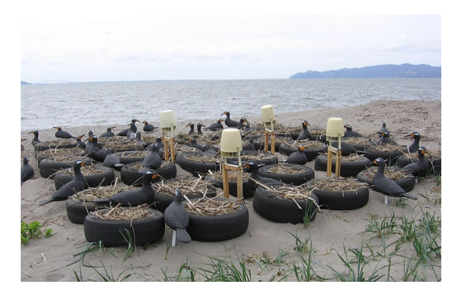
Figure 2. Test plot on Rice Island in the Columbia River (Pacific Northwest, USA) estuary, created in 2006, to attract double-crested cormorants using habitat enhancement and social attraction techniques.

We conducted a single on-the-ground survey at each test plot during the chick-rearing period to count nest structures and numbers of nestlings. In order to minimize gull ( Larus